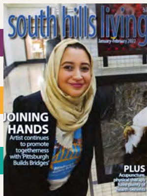
Cover of South Hills Living Magazine