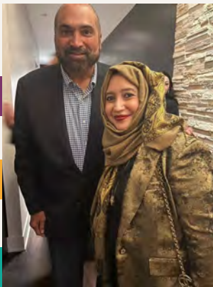
Former Steeler Franco Harris