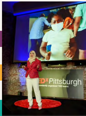
TEDx Pittsburgh 2023 Speaker