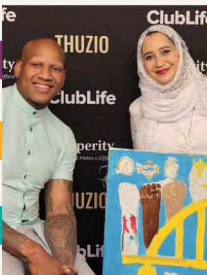
Former Steeler Ryan Shazier