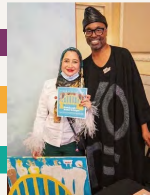
Actor Billy Porter