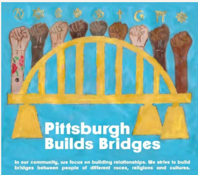
Pittsburgh Builds Bridges Painting

To date, the initiative has brought together over 4,000 children and adults from all levels of grade schools, from elementary to high school, public and private, universities, and with the involvement of actors, professional athletes, and city officials to create murals that symbolize unity and harmony and to engage in discussions about building bridges in their communities.